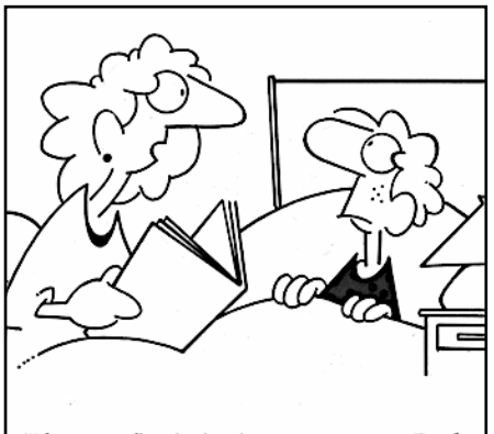
"The great flood wiped out everyone on Earth except for Noah, because he kept his room clean, did his homework and ate all of his vegetables!"

Project Compassion is a practical means of enabling us to reach out in